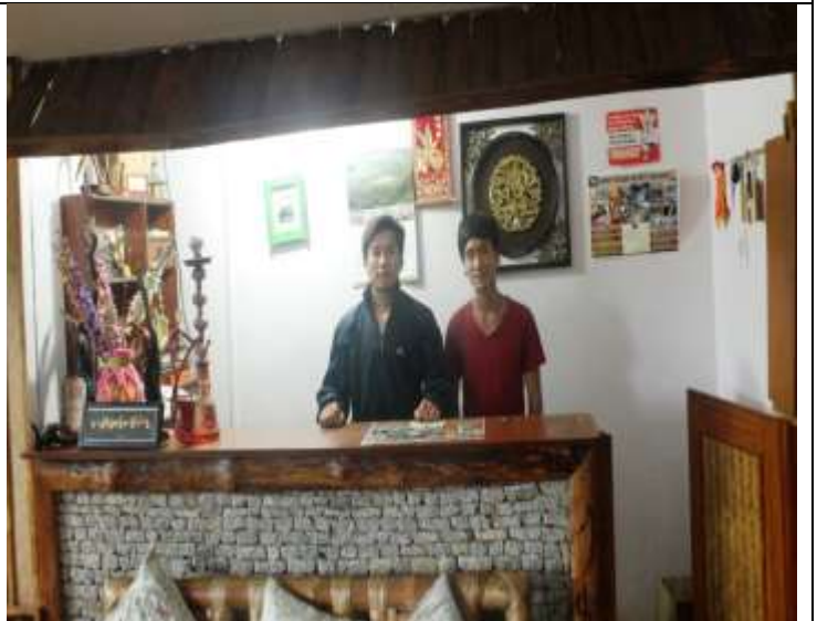
Local staff employed at the lodge