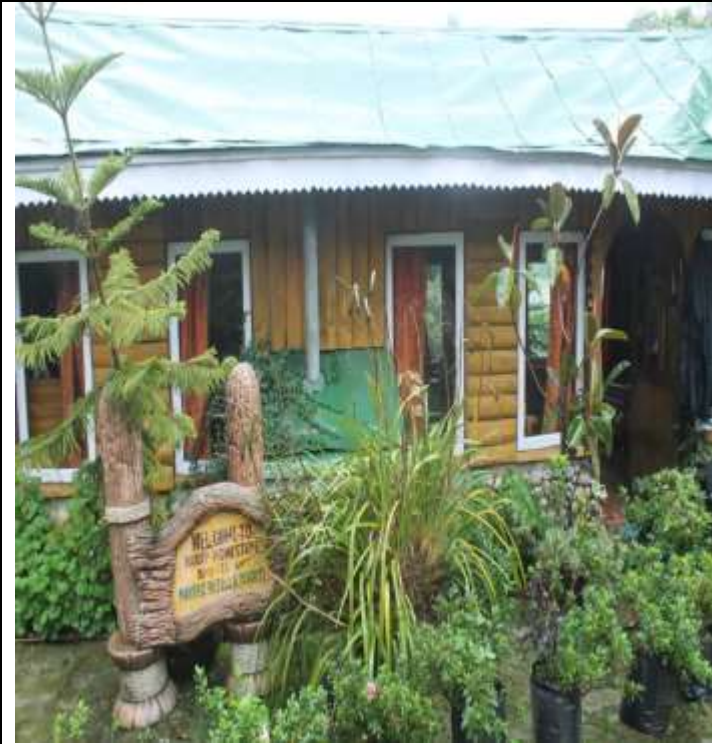
Entrance to the lodge