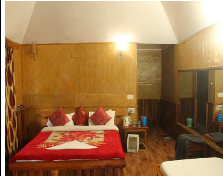
A double bed room with attached toilet. The beds are made of logs from the surrounding area