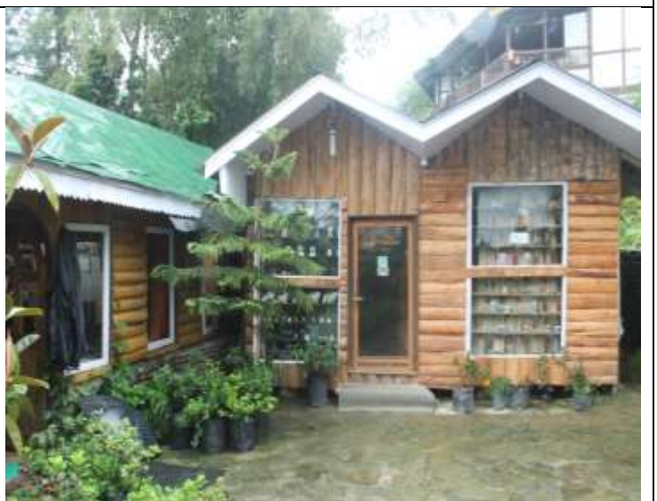
Curio shop at the lodge