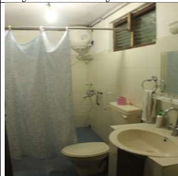
Bathroom facilities with hot water